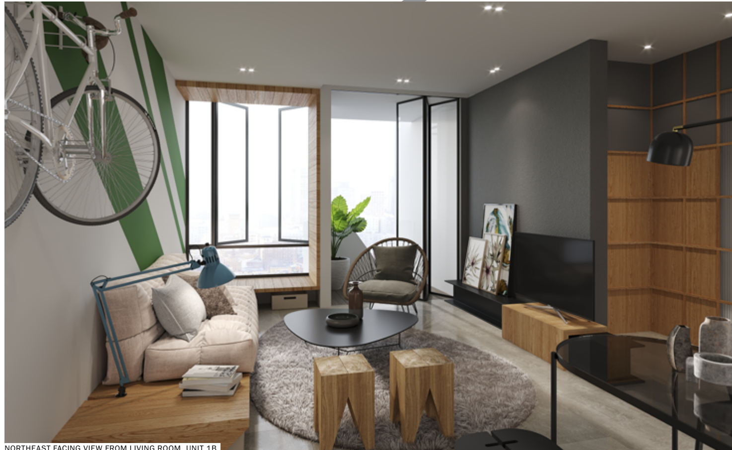
NORTHEAST FACING VIEW FROM LIVING ROOM, UNIT 1B