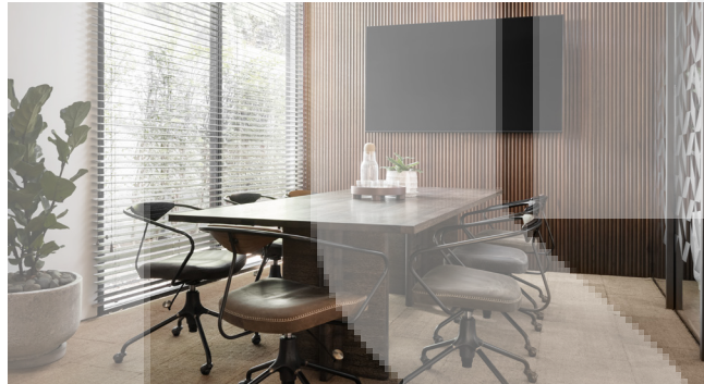
ODOM BUYERS CAN WORK WITH THE INTERIOR DESIGNER OF THEIR CHOICE TO DESIGN THE PERFECT OFFICE SOLUTION. ABOVE IS ONE OF THE LAYOUT OPTIONS PROPOSED FOR THE VERSATILE OFFICE SPACES AVAILABLE AT ODOM FOR COMPANIES OF ALL SIZES.